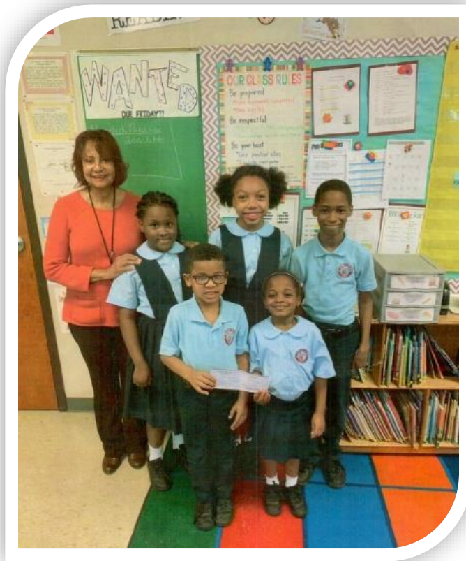
New Orleans, Louisiana